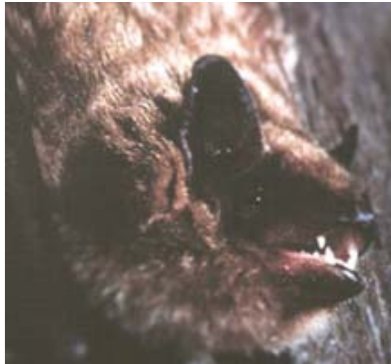
A little brown bat

These bats are the most widespread of all bats in the United States. Hoary bats also are Hawaii's only native land mammal. Humans rarely see these bats because they are not attracted to houses and keep themselves well-hidden in plants and trees throughout the day. They typically roost in trees along forest borders. The hoary bat has a body size of a fat mouse and a wingspan of around 17 inches.